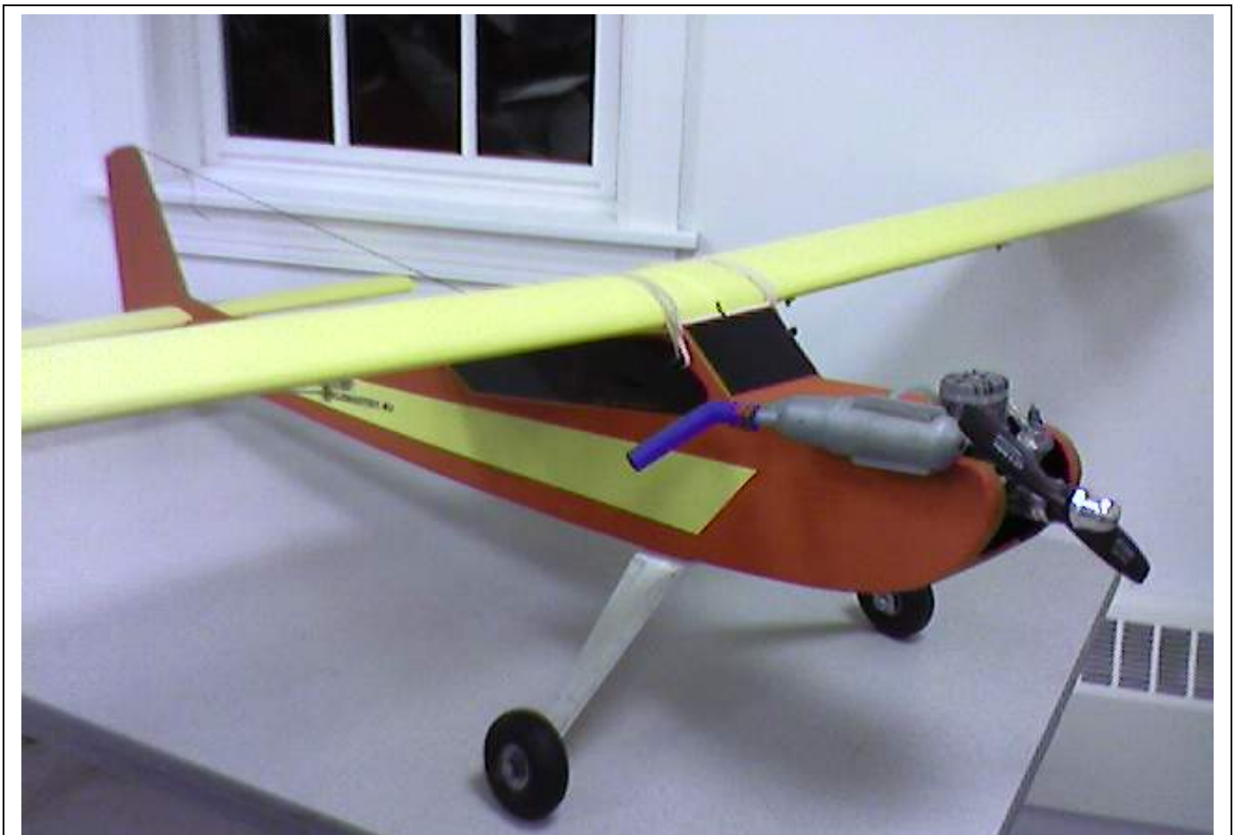
Telemaster 40 powered with a Thunder Tiger 40. Solatex covering & complete with flaps Built by John Behne. Tom Vernon says it flies great.