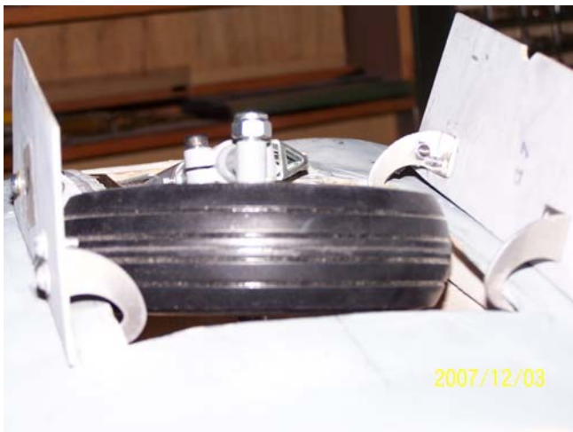
Wheel Well Detail