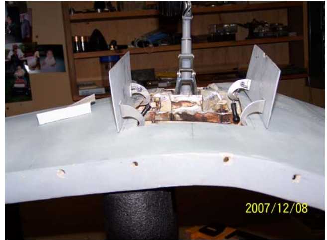
Retract mechanism details