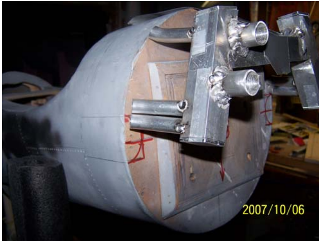
Custom exhaust for the Zenoh 62