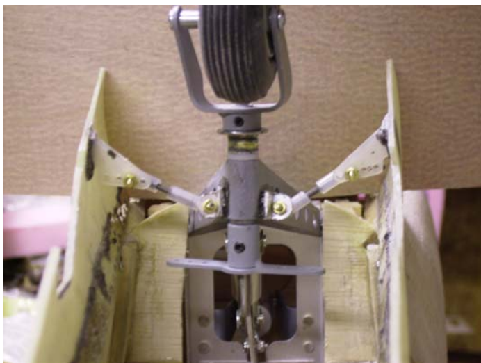
Retractable Tail-wheel Closing Mechanism