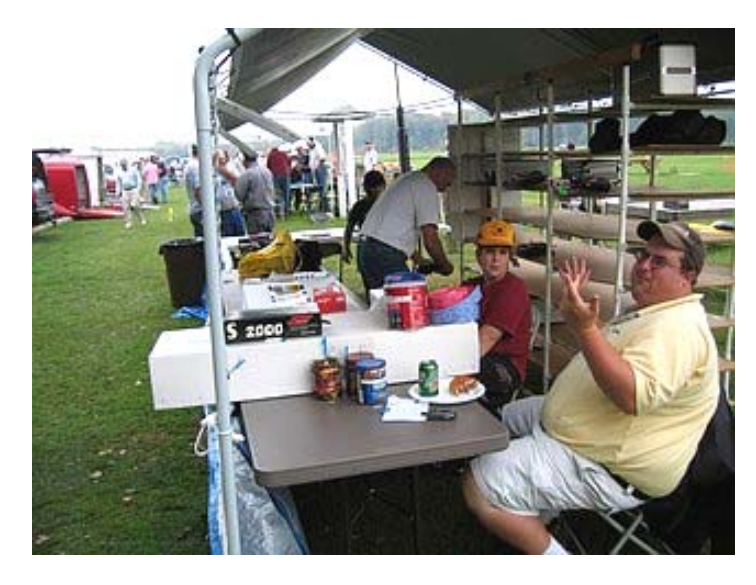
THE IMPOUND GANG