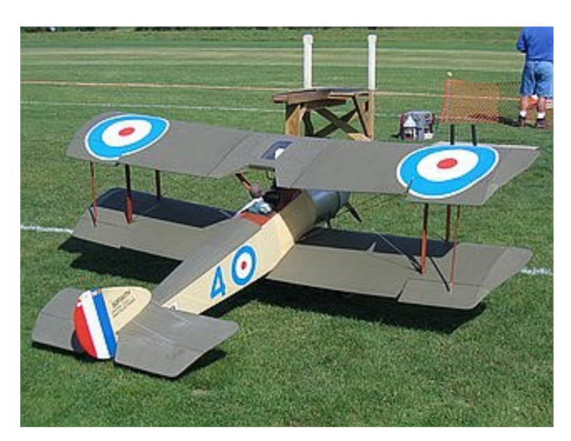
MIKE LAPIERRE'S 1/3 SCALE SOPWORTH PUP