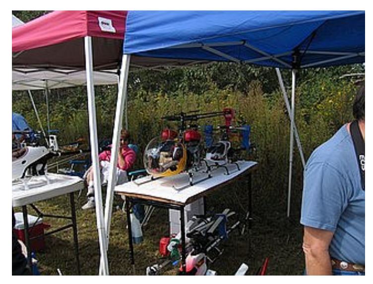
MORE SCALE HELI'S