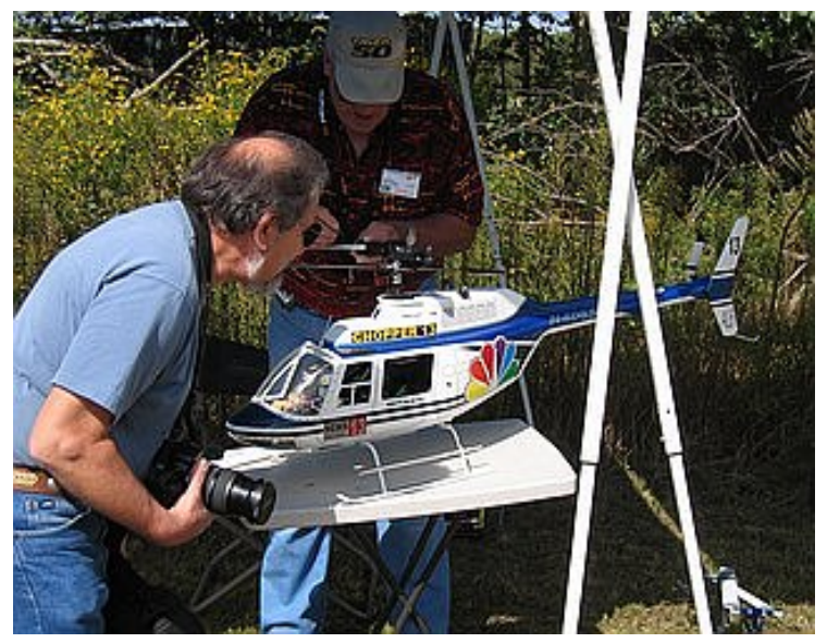
ONE OF THE HELI GUYS