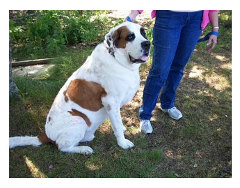
NEW CLUB MASCOT