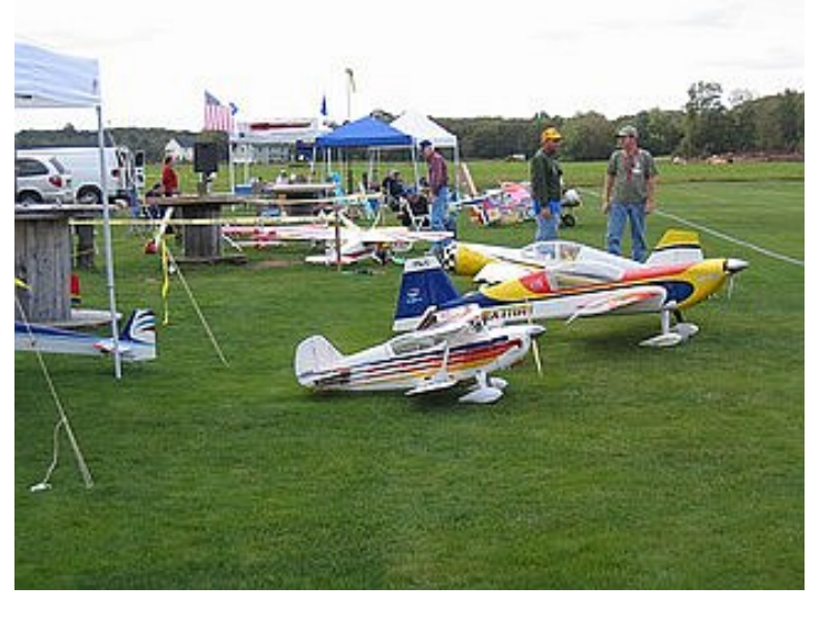
FLIGHT LINE LOOKING WEST