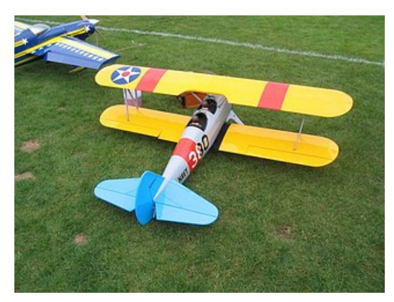
GP STEARMAN, FLIES GREAT